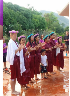
All 7 baptism candidates, after their baptism