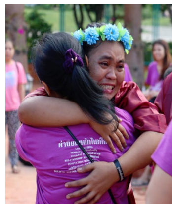
A special moment of joy and a hug of encouragement after Sky's* baptism