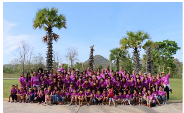
All 92 NightLight staff, volunteers and children

Her loud cry of joy held so much – it was her release from time held bound by idols and idol worship, the release from time held in bondage working in the sex industry just to make enough money to make ends meet, the release from the feelings of worthless with no purpose and the release from feeling ashamed.