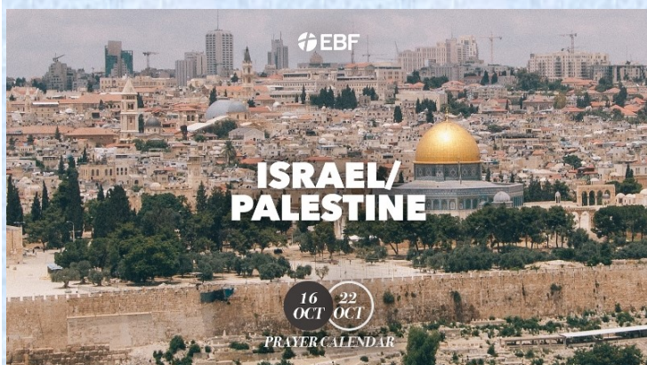
Baptists across Israel and the Palestinian Territories